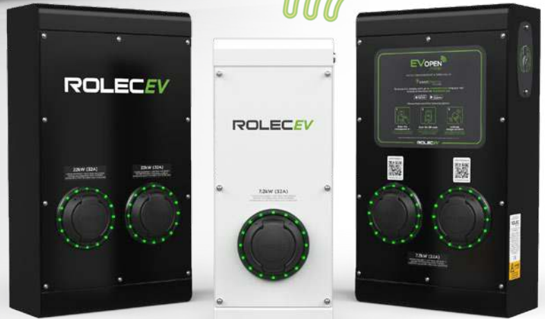
SECURICHARGE:EV SUPERFAST FREE TO USE 2way Charging Unit

Compatible with all EVs/PHEVs, the SECURICHARGE:EV provides Mode 3 fast charging in both 3.6kW and 7.2kW, as well as SuperFast 11kW and 22kW speeds.