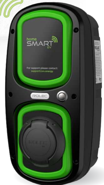
Unit shown: WALLPOD:EV HOMESMART EV Type 2, Mode 3 Charging Socket

The WallPod:EV HOMESMART is a smart charging unit which has been designed to provide the user with a simple, mobile phone interactive EV charging solution for the home.